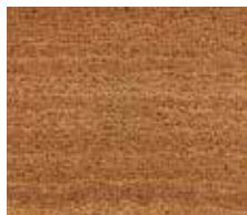
Naturel K19 NCS: 3040Y20R